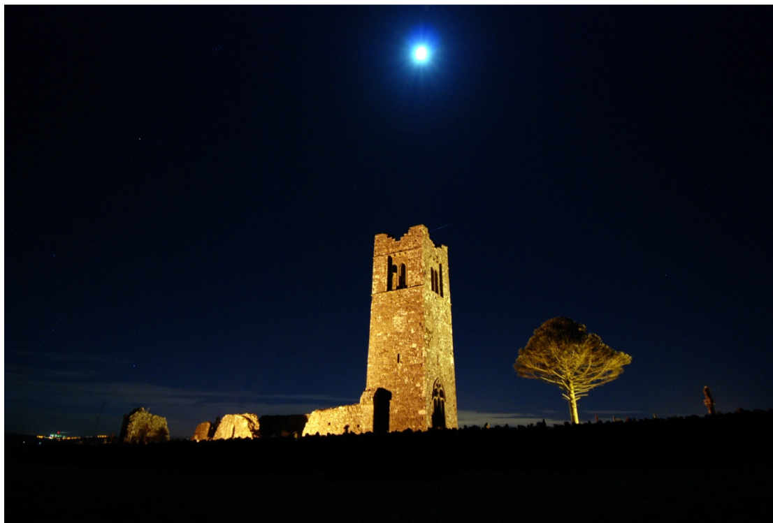
Hill of Slane at Night

Leaving or throwing litter in a public place or in any place that is visible from a public place is an offence which can be subject to an on the spot fine of €150 or a maximum court fine of €4,000. A person convicted of a litter offence will also be required to pay the local authority's costs and expenses in investigating the offence and bringing the prosecution to court, including legal fees.