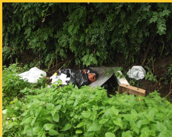
Blight on the Landscape

To the Environment Staff of Meath County Council, this picture is commonplace. Every day calls come into the office regarding illegal dumping. Not only is it costly to remove, it destroys the County in which we live and it potentially put off Tourists and Investors and jeopardises future economic development.