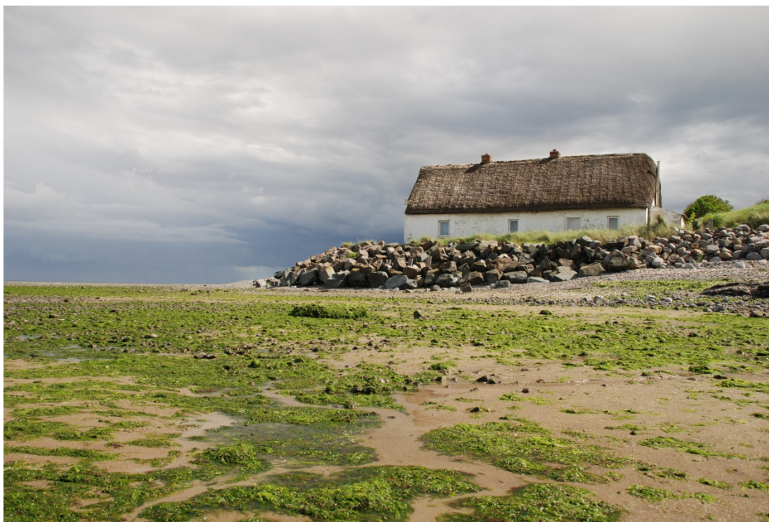
Laytown Thatch

Every effort will be made to increase the numbers participating in Green Schools, Pride of Place, Spring Clean, Green Dog Walkers Programme and other such environmental campaigns all of which are hugely effective in the fight against litter.