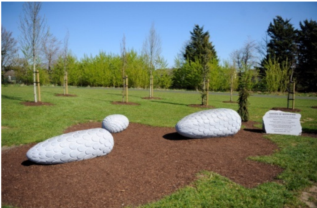
Blackwater Park, Navan