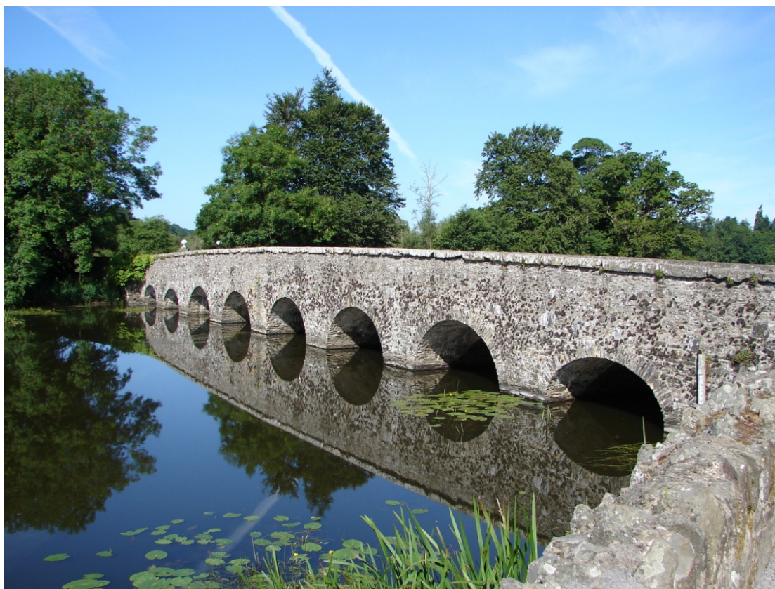
Headfort Bridge Kells

Major and Minor Events generating litter – Events such as sporting events, concerts, festivals etc. can generate a substantial amount of litter. The nature of the litter is usually casual and package related. Events Management Plans deal with waste and litter arising as part of the planning process for large events.