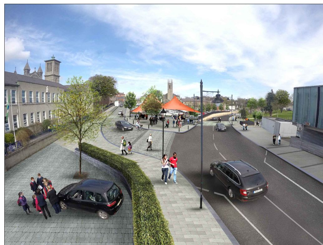
Proposed Fair Green