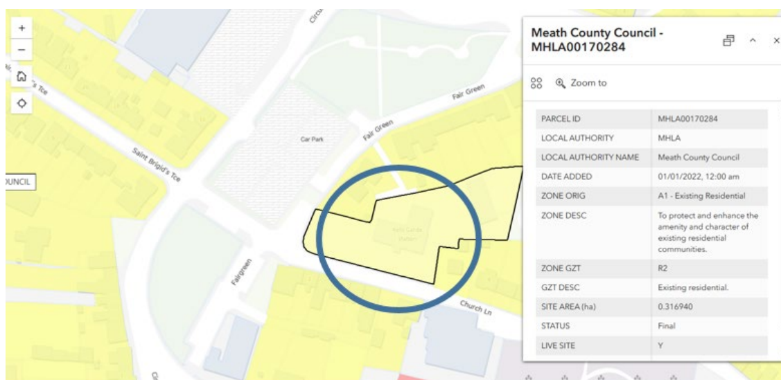
Figure 3: Current Zoning Objective

The subject land is currently Existing residential: To protect and enhance the amenity and character of the existing residential communities.