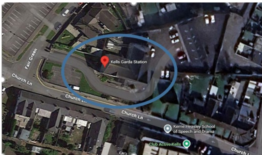
Figure 1: Location of Subject Property

The subject land parcel – MHLA00170284 - included on the Annual Draft Map as being within scope of the tax measure.