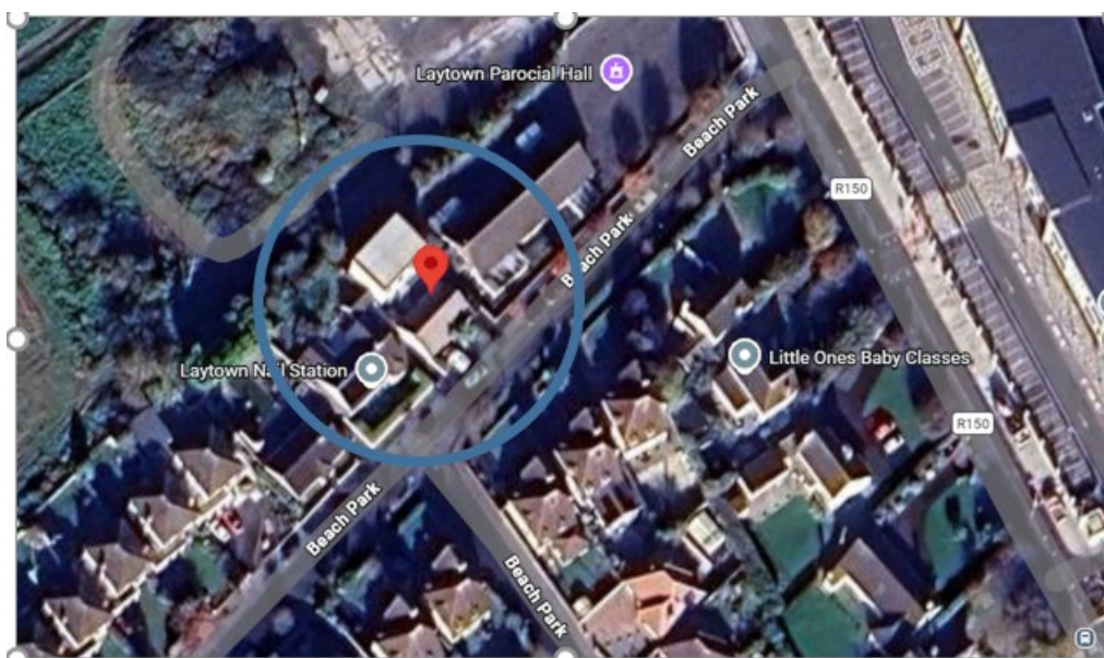
Figure 1: Location of Subject Property

The subject land parcel – MHLA00040495 - included on the Annual Draft Map as being within scope of the tax measure.