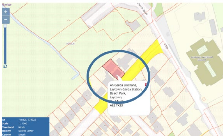
Figure 2: Tailte Eireann Map 1:1000